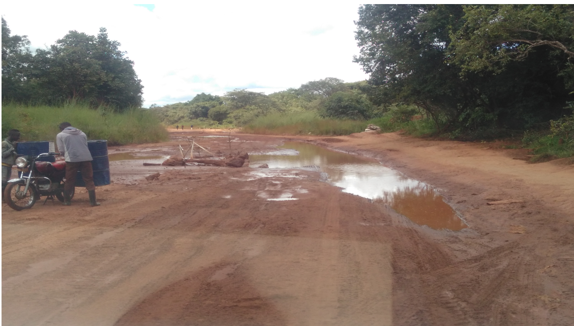
Road to Kisankala Village

In the rainy season, the access road from the national highway leading to Kisankala is especially poor and often impassable due to damage caused by heavy trucks going to and from Swanmines.