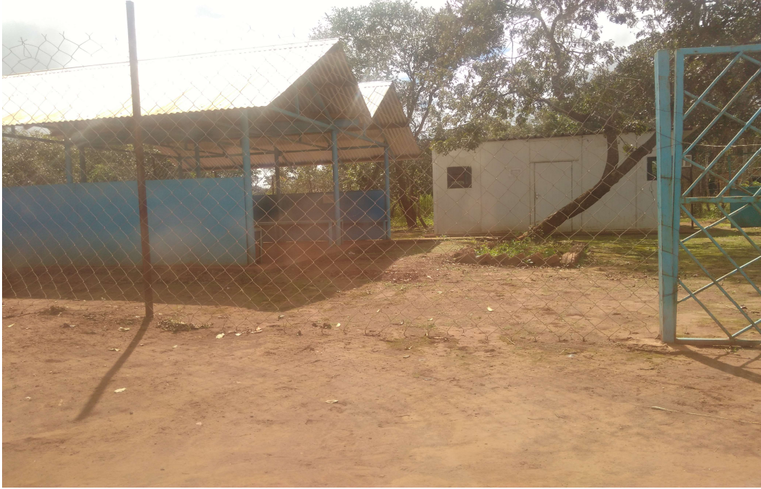
(Kisankala Health Centre closed. AFREWATCH, 22 March 2017)

At Lenge the company has not undertaken any community development projects and health care has not been provided. Furthermore, the paths (underneath transmission lines) that many local residents from Lenge used as short cuts across the concession to reach the main trading centres of Lualaba and Kolwezi city have been blocked. Lenge residents used these paths to get food from local markets, take their produce to sell along the national highway, reach health clinics and take their children to school. The blocking of the paths mean local residents need to walk up to 10 – 15 extra kilometres. Nothing has been put in place to facilitate transport or to help them leave, enter or cross the concession safely.