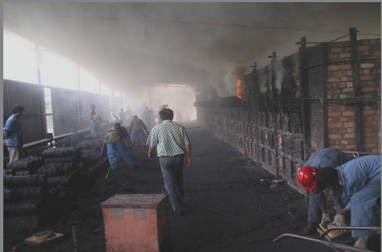
Chinese Coke factory in Zimbabwe which supplied Chinese mining companies in Katanga